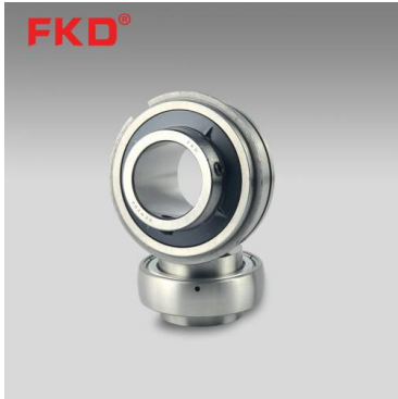
SER 200 (normal-duty)