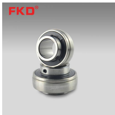
UC 200 (normal-duty)